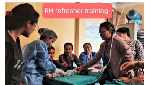
Nurse midwives participating in a refresher training course