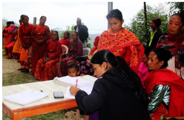
Mulkharka health camp.