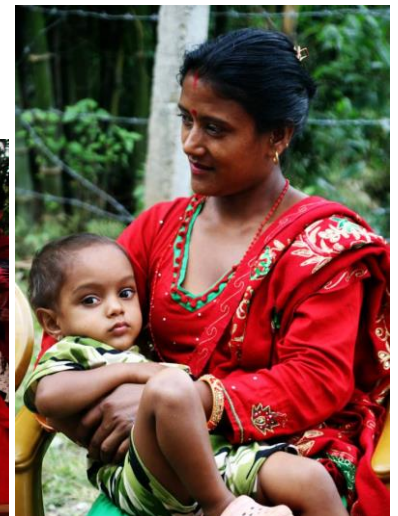
Ramechhap health camp.